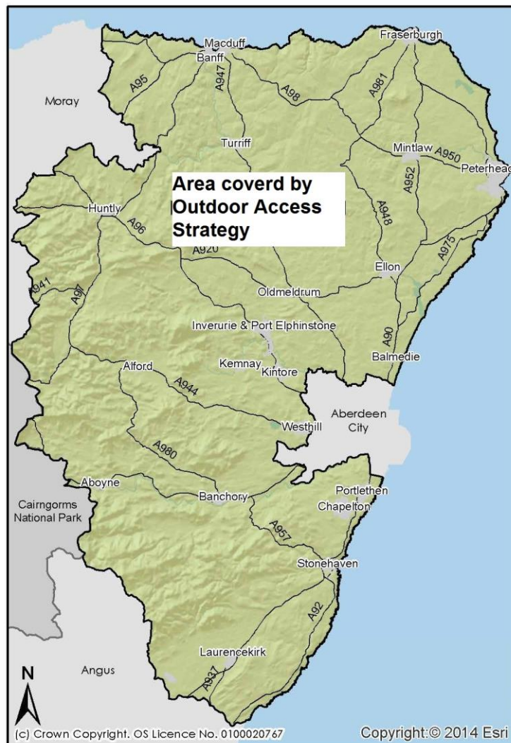
Map 1: Area covered by Outdoor Access Strategy

The Strategy focusses on the efficient and effective management and enhancement of existing paths and associated infrastructure. Associated infrastructure involves bridges, signage, gates, benches, fencing and other infrastructure which supports the path network. The Strategy also outlines aims and objectives in relation to the development of new facilities, in particularly how we will work with other Services, external bodies and communities. The Strategy aims to promote and deliver responsible outdoor access that provides social, environmental and economic benefits. Overall it will aim to ensure that efficiency and best value are delivered from available Council resources.