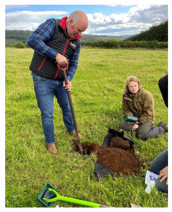
Superb soils day at Meikle Maldron