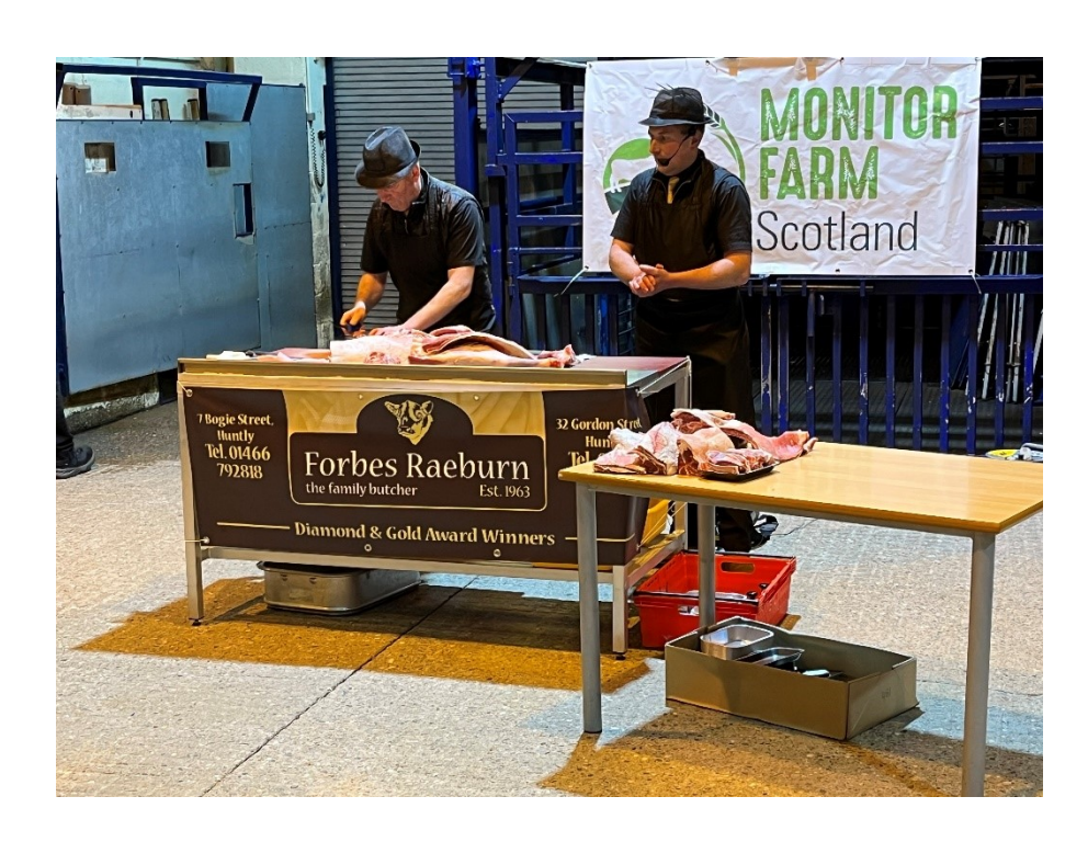
Vets & Butchers 130 attendees