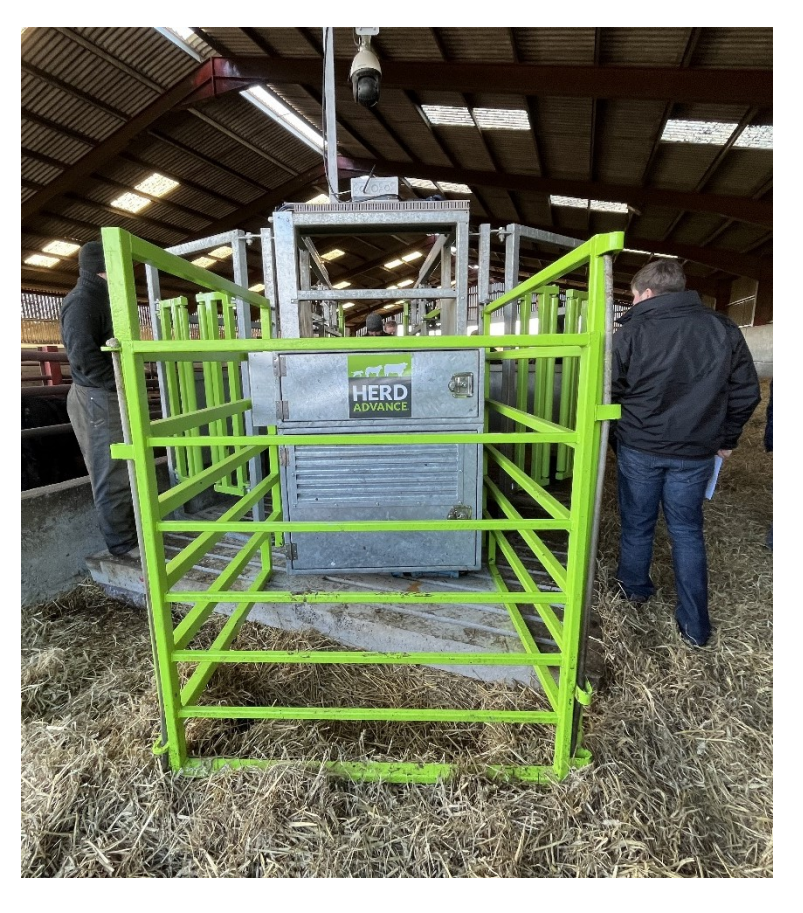
HerdAdvance – livestock drafting