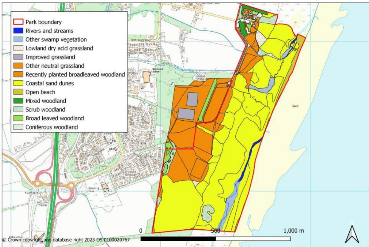
Figure 2 - habitat map