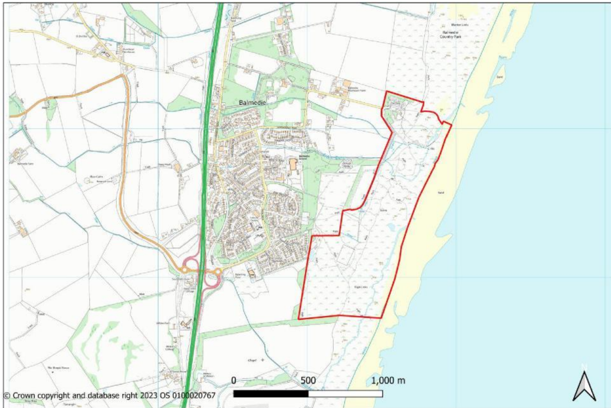
Figure 1 - Balmedie Country Park location

Balmedie Country Park is located on the eastern side of the village of Balmedie, 8 miles north of the city of Aberdeen in Aberdeenshire, as shown in Figure 1 below.